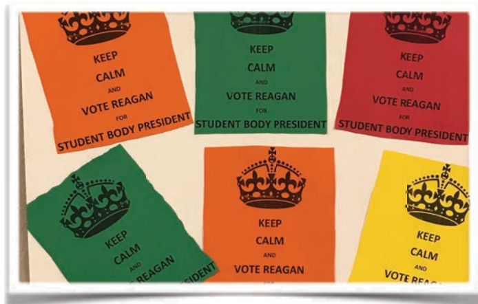
Student Council Election Posters